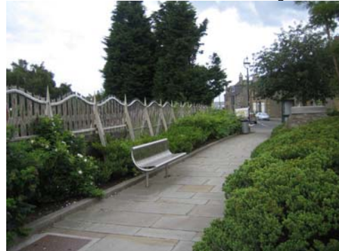
A pleasant walkway to town, Loanhead, Scotland

Green spaces and play spaces can also provide further reason for people to visit their town centre, as well as encouraging them to stay longer when they do. Design can create adaptable spaces where people of all ages and abilities can work, rest, relax and play.