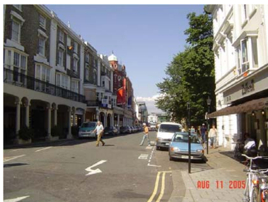
New Road – before