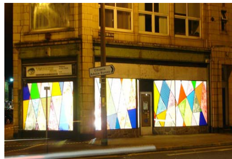
Artwork: Noel Cluett

Encouraging mixed use of public buildings such as libraries and community halls can provide an indoor extension of the public space that can house cafés, galleries, stalls, internet access, and host community gatherings such as music recitals, relaxation classes, book clubs and storytelling, workshops and presentations. Some of these might take place after usual closing hours, increasing local footfall and a more varied social scene into the evening.