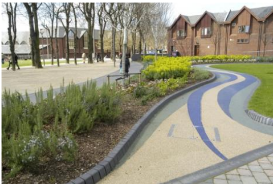
In Walthamstow, the redeveloped square, gardens and high street provide a safe and attractive link between the main transport hub and the central shopping area.